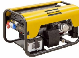
Genset image for illustration purposes only