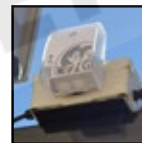
Light sensitive switch