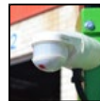
Overview of motion detector for outdoor use